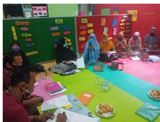
Figure 2. Conditions of Monthly Meetings Attended by Kindergartens in Biringkanaya District, Makassar City.

The Teacher Activity Center (PKG) of Biringkanaya District in Figure 2. carries out various activities by sharing knowledge through routine meetings every month. However, these routine activities are less than optimal because these activities are not accompanied by several resource persons or experts in their fields, sharing experiences and knowledge that they do with fellow teachers in Biringkanaya District. Some of the obstacles faced by PKG Kec. Biringkanaya with the lack of human resources who are experts in their fields on each problem presented at routine PKG meetings, PKG activities that are only made into meeting agendas for the current situation of teacher needs (Lathifah, 2016; Wijaya & Hidayat, 2022; Budiati, 2018).