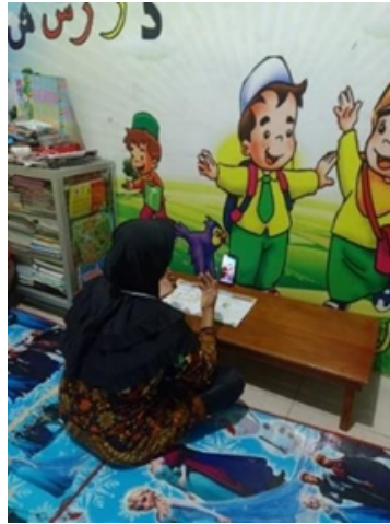
Figure 3. Teacher Takes Video Recording of Learning Using a Mobile Phone Manually.

Based on the results of the PKM Team survey, Activity Figure 3 obstacles faced by PKG teachers in Biringkanaya District are the lack of creativity of PKG teachers in Biringkanaya District in developing their knowledge both in the field of teaching and in socialization in PKG activities in Biringkanaya District. Lack of teacher motivation to carry out activities that develop teacher competence because of funding constraints that only rely on contributions from each school for PKG activities in Biringkanaya District, which is also difficult to collect by all schools that contribute to PKG in Biringkanaya District.