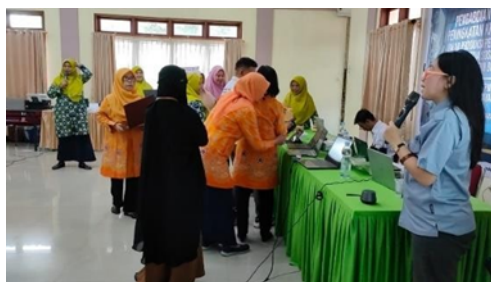
Figure 6. Implementation of Digital Media Technology, Namely Websites, YouTube and Other Social Media

Technology Implementation Stage, in this stage it is expected that partners can utilize the usefulness of digital technology, namely websites, YouTube accounts and social media accounts in the use of teaching in schools and outside schools, providing expertise in promoting the work of kindergarten teachers on social media platforms, websites and YouTube. The technology implementation stage will be carried out by providing knowledge and assistance to partners regarding techniques, applications, and applications in publishing the results of their digitalization work into social media platforms to make them look attractive and creative.