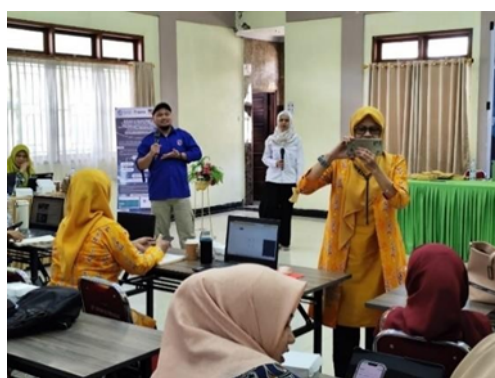
Figure 9. Storytelling Video Production Training Using Applications