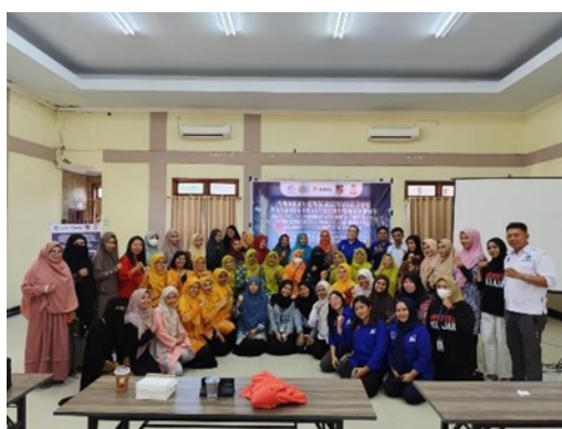
Figure 5. Documentation of Training Activities for Using PKG Partner Websites, YouTube and Social Media.

Technology Implementation Stage, in this stage it is expected that partners can utilize the usefulness of digital technology, namely websites, YouTube accounts and social media accounts in the use of teaching in schools and outside schools, providing expertise in promoting the work of kindergarten teachers on social media platforms, websites and YouTube. The technology implementation stage will be carried out by providing knowledge and assistance to partners regarding techniques, applications, and applications in publishing the results of their digitalization work into social media platforms to make them look attractive and creative.