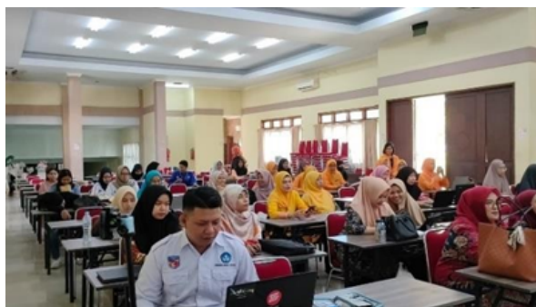
Figure 4. Documentation of Training Activities for Making Storytelling Video Production Using Applications

as a medium for increasing partner creativity and marketing digital video production results as income or income for partners.