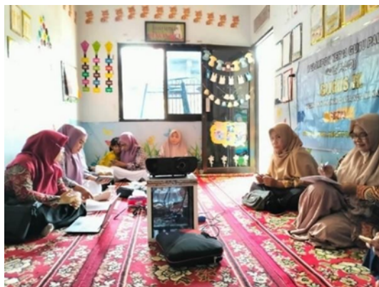
Figure 1. Documentation of PKG Activities in Biringkanaya District, Makassar City, 2024.

As done by the association of Kindergarten teachers in Biringkanaya District, Makassar City, which is gathered in the Teacher Activity Center (PKG) organization in Biringkanaya District, Makassar City. PKG in Biringkanaya District, Makassar City aims to develop the potential of teachers in Biringkanaya District, Makassar City. With various activities they do, such as holding training on the Merdeka Curriculum Platform (Visi & Misi – PKG Makassar, n.d.).