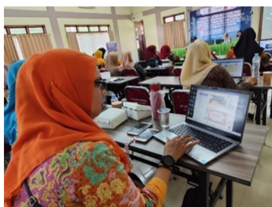
Figure 10. Training on the Use of the PKG Website in Biringkanaya District, Makassar City Partner participation in this PKM activity is by compiling scenarios or stories that can be

used as digital videos, namely video storytelling, from the results of observations and knowledge of Biringkanaya District teachers who can assist in compiling story ideas for making video storytelling (Julianingsih & Krisnawati, 2019).